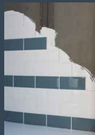
Simple installation and secure base for ceramic tiles